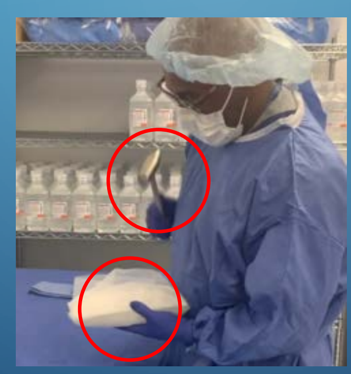
Baxter Sterile Container System